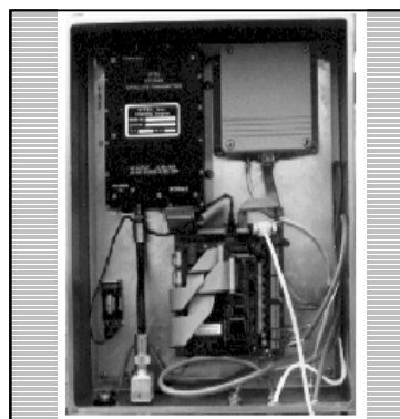
MicroDCP, digital barometer, and satellite transmitter in stainless weatherproof