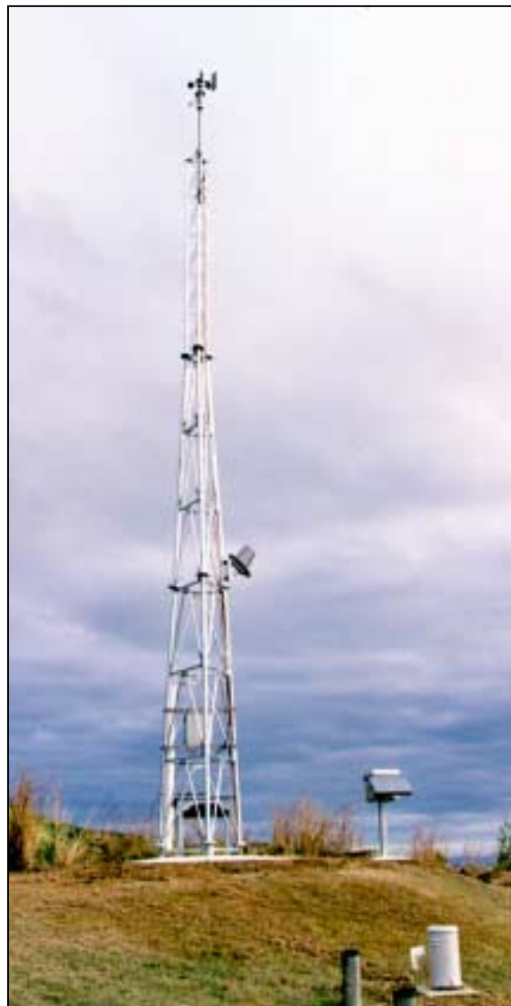
Autonomous SYNOP Station with geostationary satellite transmitter and solar electric power supply.

The station automatically assembles the SYNOP and SPECI messages according to your regional and national requirements. Message templates can be modified if there is a change in WMO formats, or if you require different types of reports for your network.